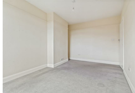
Lounge 19'0 x 11'11 (5.79m x 3.63m)